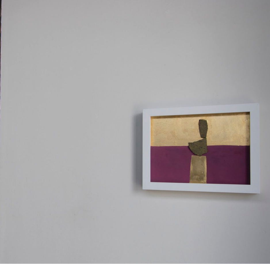
Vita Art Center Ventura, Ca. 2017