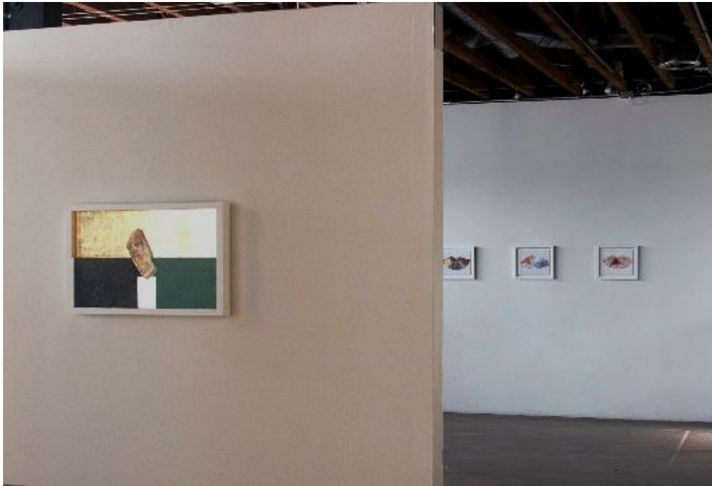
Vita Art Center Ventura, Ca. 2017