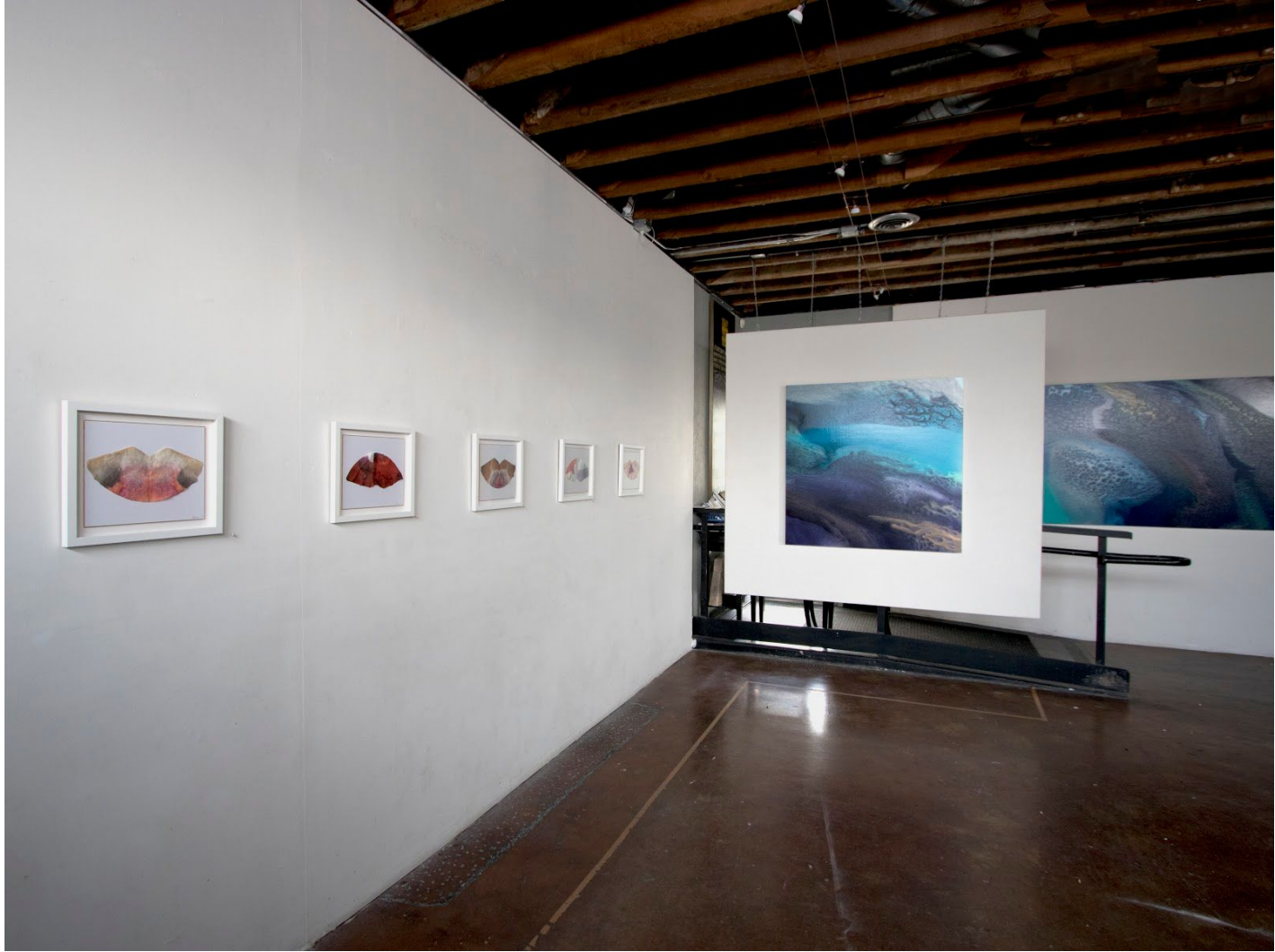
Vita Art Center Ventura, Ca. 2017