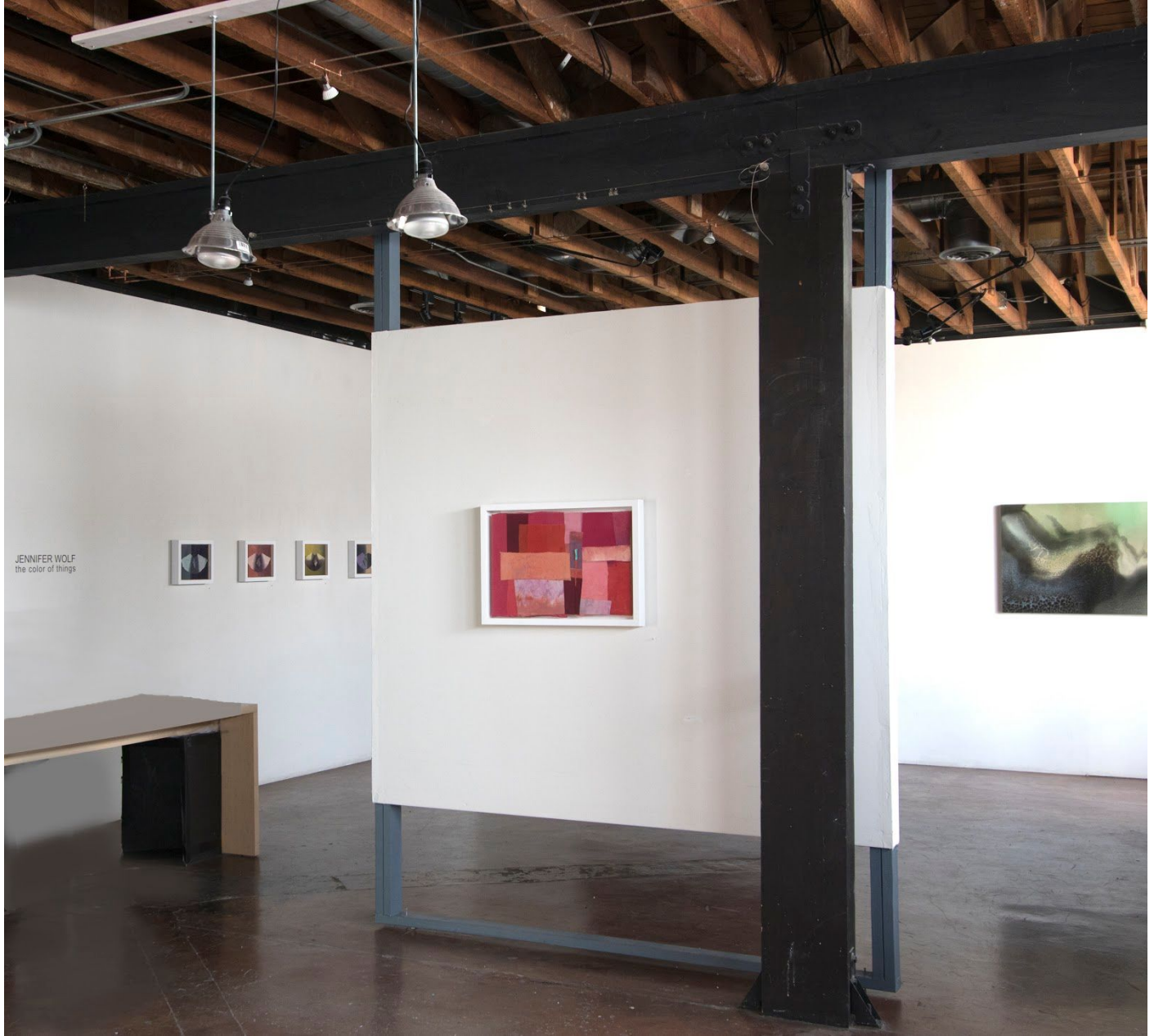
Vita Art Center Ventura, Ca. 2017