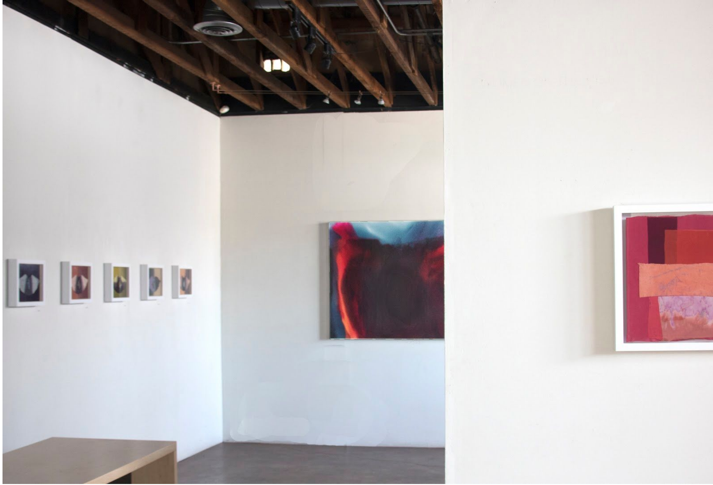
Vita Art Center Ventura, Ca. 2017