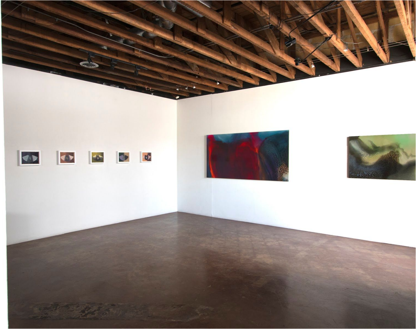
Vita Art Center Ventura, Ca. 2017